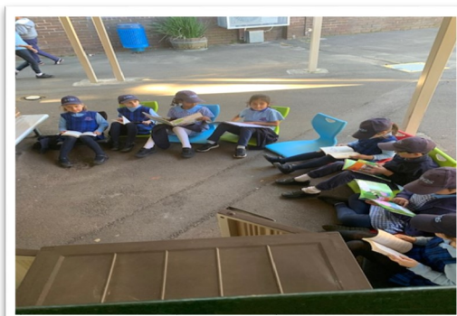
Students enjoying the outdoor reading Library.

The staff during the past one and a half terms have been involved in developing the school's shared beliefs and understandings about student learning. They are: