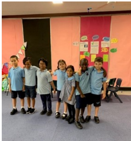
These students in 2P are all wearing the correct shoes.

Our wonderful P&C group met last week and agreed with the school on a renewed and stronger focus on compliance with school uniform requirements. An important part of the P&C's role is to be involved with school decision-making and new members are always welcome. Our first focus for uniform comes from the ground up where we expect all students to wear plain black shoes. A white sole on the shoe is acceptable. Please ensure your child wears plain black shoes to school every day.